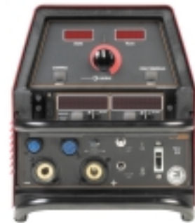
Advanced Process Model (K1728-7)