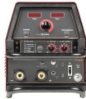
Construction Model (K1728-5)