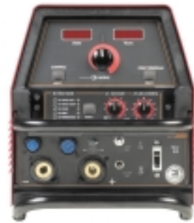
Factory Model (K1728-6)