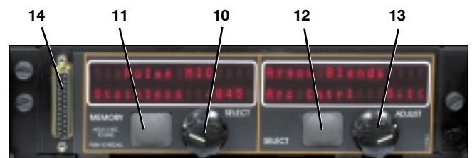
Advanced Process Panel